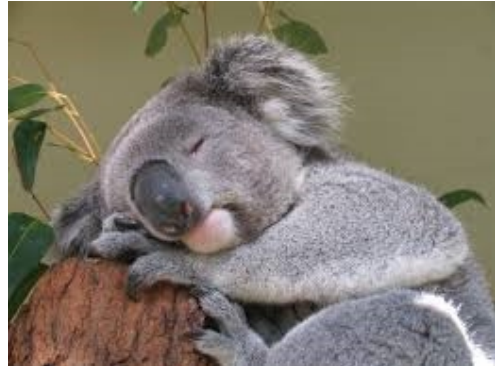
After all the leaves and shoots are eaten