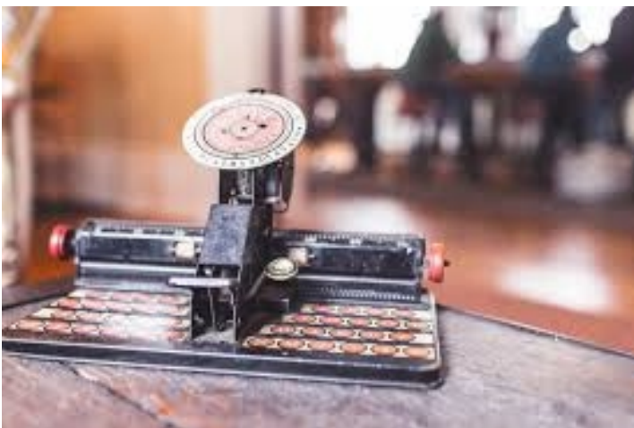
An 1868 Model