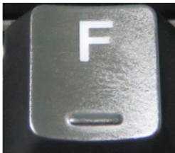
Finger Tab on F, J, and 5