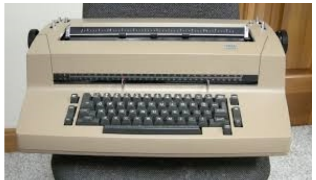
The IBM Selectric