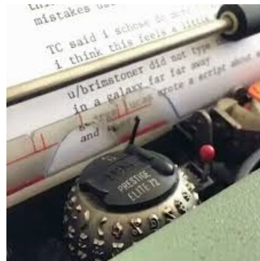
A Selectric Type Ball